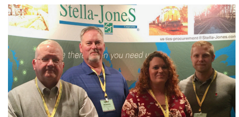
A team from Stella-Jones exhibited at HMA.