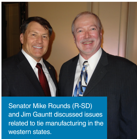
Senator Mike Rounds (R-SD) and Jim Gauntt discussed issues related to tie manufacturing in the western states.